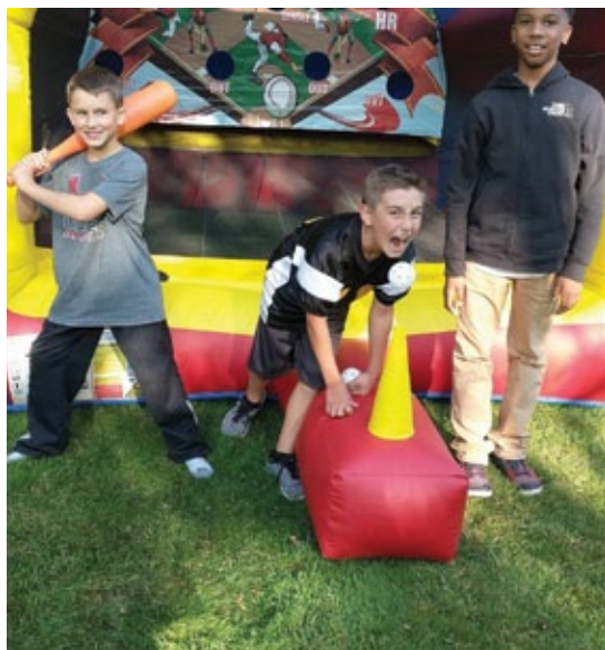
Family Fun Days activities

Please use the enclosed self-addressed envelope to make a tax-deductible donation. For information on opportunities to connect & give, contact Peggy K. Goodwin at St. Anne's Mead - 248-557-1221